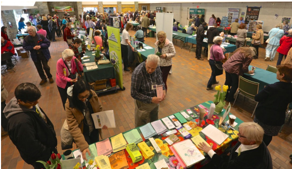
Bottom Left: The Floral Hall at the Toronto Botanical Garden is abuzz with activity as visitors enjoy the day