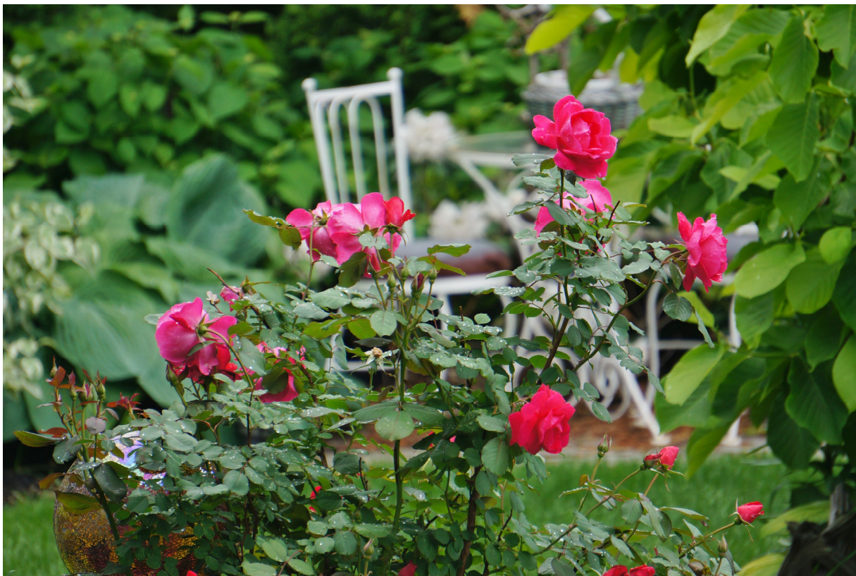
Soon nature's beauty will be in full bloom.