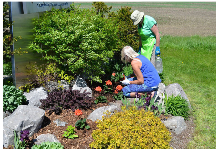
The lighthouse garden on the Highway 81 entrance to Grand Bend that the society looks after.

Ever since the world's existed There's one thing that is certain Some people build walls Others open doors