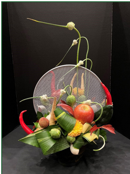
Best in Show - Behind the Fence, a transparency design - Lil Taggart