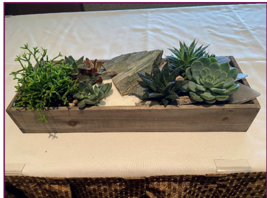
Special Exhibit - Dish Garden

Review and Demonstration of Special Exhibits – Over 50 people were in attendance to hear Judy Fine, a well-known floral designer and OHA certified and GCO accredited floral design judge, review definitions in OJES for Special Exhibits which form a separate Division in our Flower Shows, and watch her demonstrate each of them including the following: Plants and Flowers, Dish Garden and Fairy Garden (see photos).