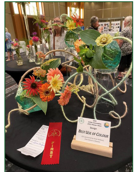
Best Use of Colour - Summer Sorbet, a synergistic design - Lynne Melnyk