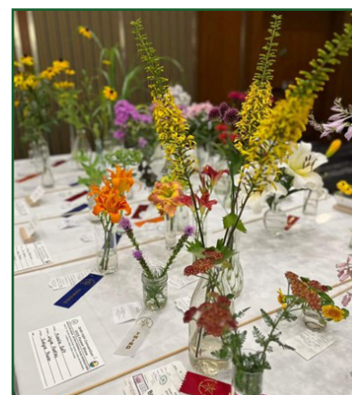
Best Cut Specimen