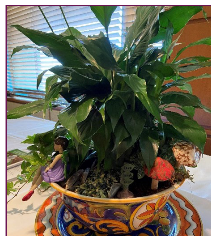
Special Exhibit - Fairy Garden