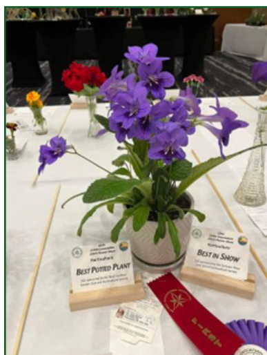
Best in Show - Best Potted Plant - Toby Barratt

Total Entries: 280 Horticulture (209), Design (63), Special Exhibits (8)