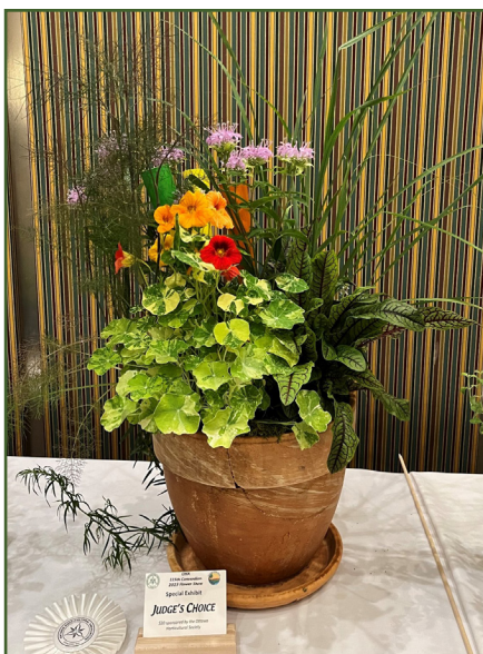
Judge's Choice - Herbs by Candlelight, a pot-et-fleur