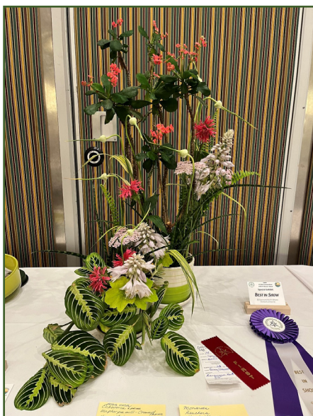
Best in Show - Summer in the City, plants and flowers