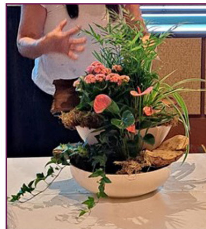
Special Exhibit - Plants and Flowers