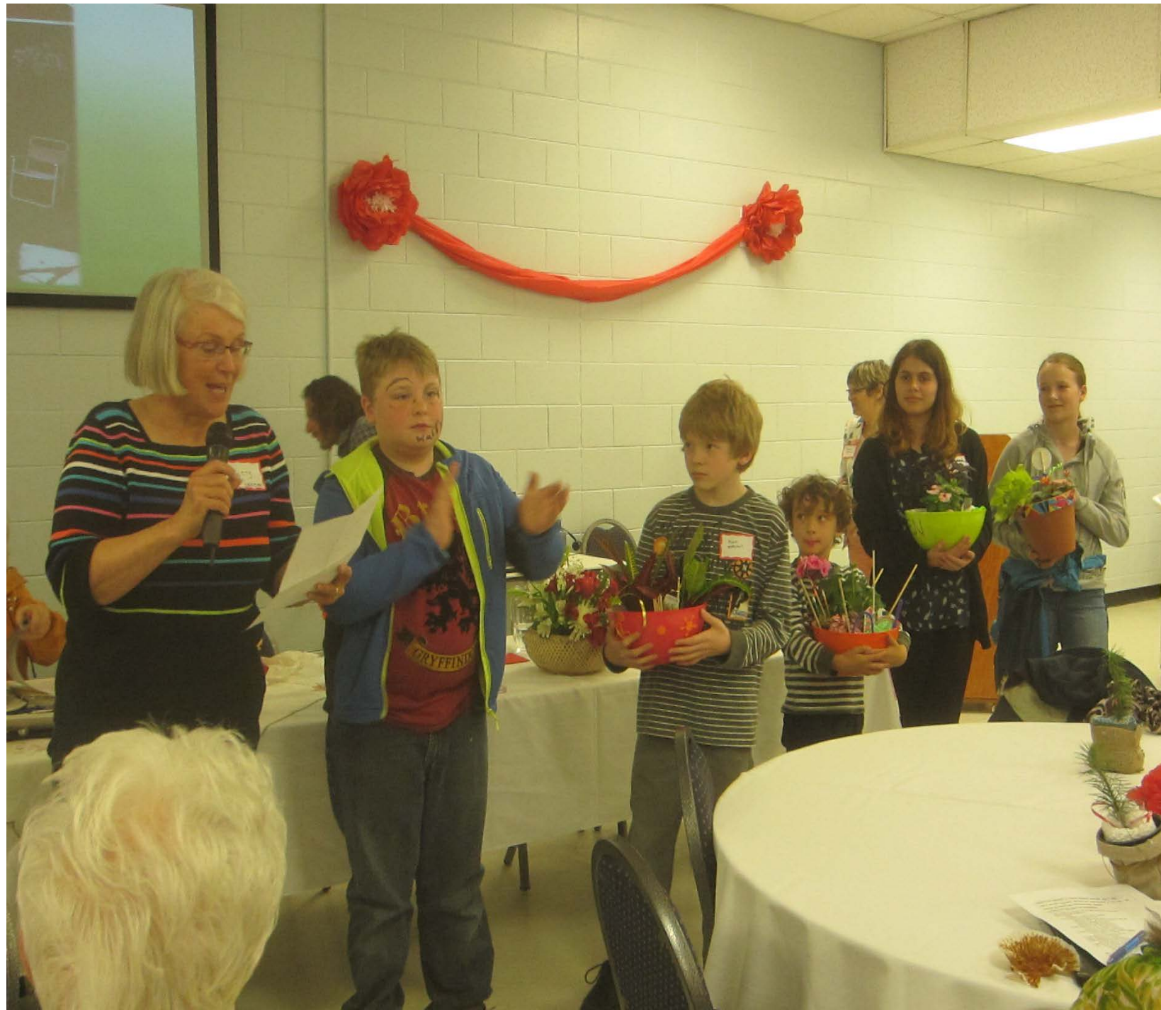
Youth Group at Bracebridge Horticultural Society AGM.