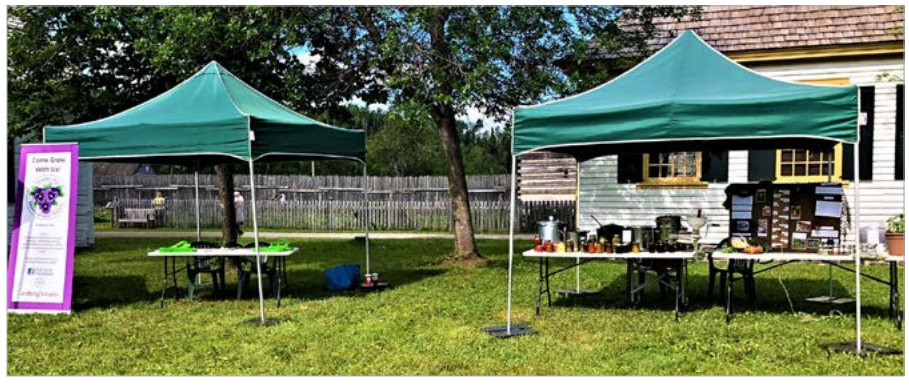
Information and Canning Booths

With fall soon approaching, we are looking forward to our Flower and Vegetable Show, Purple Flower Contest, Garden Beautification Awards, pumpkin and vegetable carving and our society AGM closing off a busy and eventful year in November.