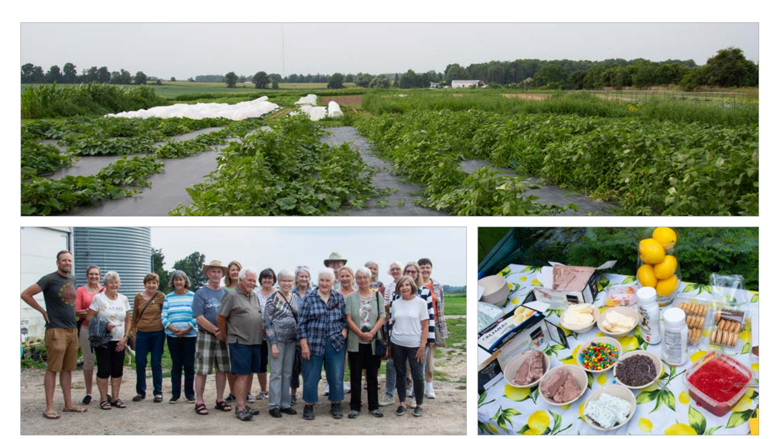
A Perfect Summer Evening