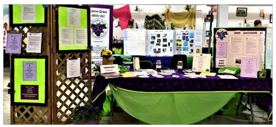
CLE Booth 2023