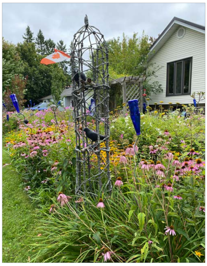
Concrete Blackbird Cage

Many attendees have posted pictures of their creations in their gardens. Mine is awaiting a coat of "Glow in the Dark" spray paint before it gets pride of place in a new garden bed on the front yard. Then I can enjoy it in the day and night time too.