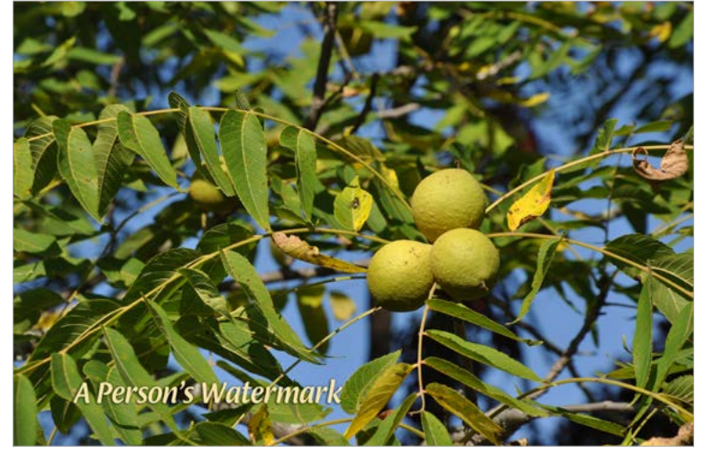
Walnut trees are one of the first to lose their leaves in the fall and the last ones to have new leaves in the spring.