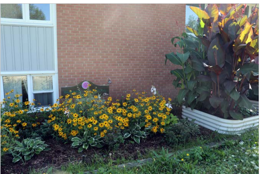
Revamped gardens at Centennial Hall in York

Take a moment to embrace the beauty of the Fall season – enjoy!