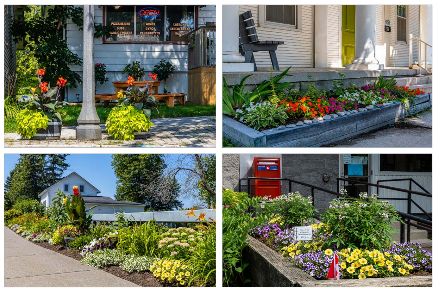
BGC Flowers on Aug 9th