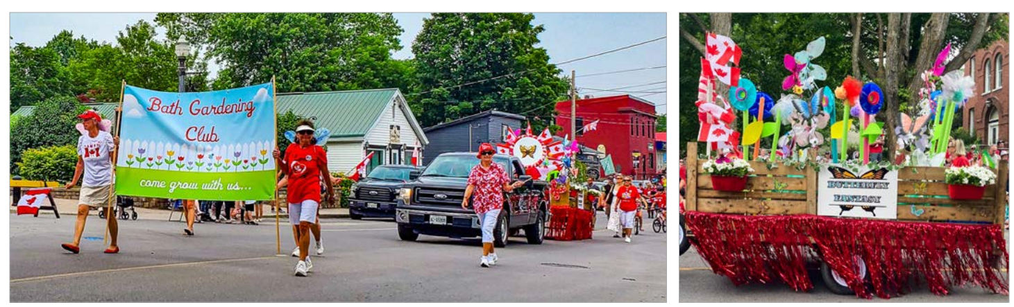
BGC Canada Day Float