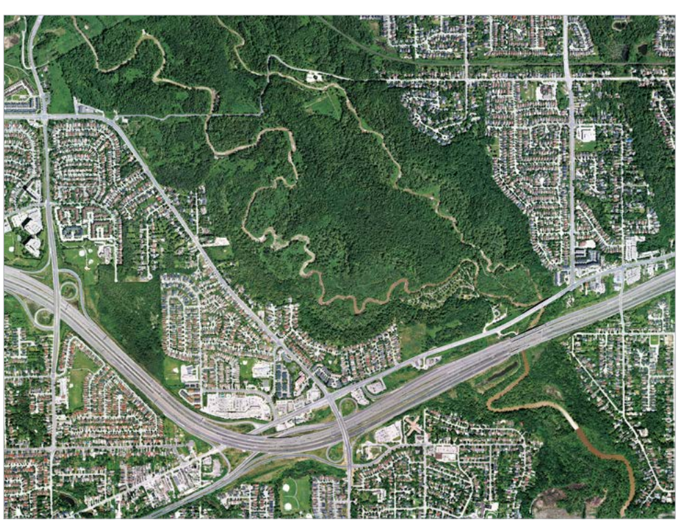
The Rouge River Valley

While Toronto ravines share many features in common and face similar threats, each one is distinct. The Rouge National Urban Park, for example, is the largest protected area in urban North America. It is home to wild blue lupin, dense blazing star and American ginseng; to northern pike, rainbow trout, pumpkinseed, brown bullhead, white perch and black crappie; and to short-eared owls, least bitterns, red-shouldered hawks, eastern loggerhead shrikes, great blue herons, and rarer birds like ovenbird, ruffled grouse, Acadian broad-winged flycatcher and hawk. Warden Woods Park boasts a mature growth forest of sugar maple, American beech and red oak but it also funnels stormwater from sixteen hectares of Highway 401 through a concrete channel built for this purpose. Combined sewer overflows and illegal residential