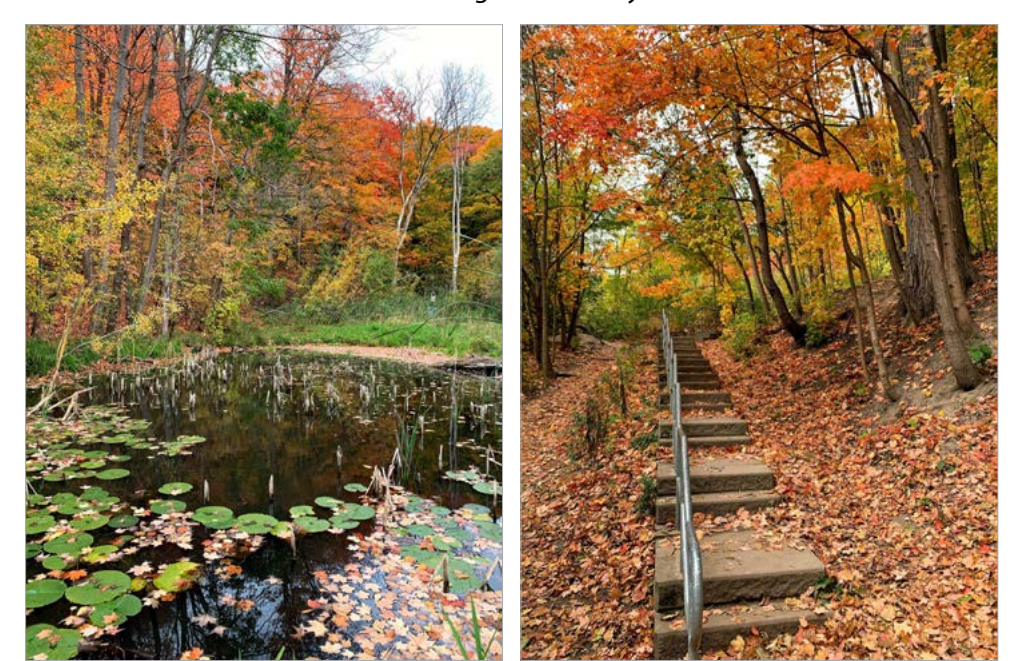
Taylor Creek Pond