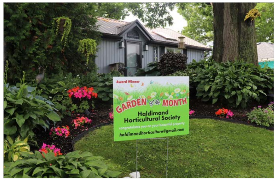
Our "Garden of the Month" for June, July and August saw 6 gardens nominated from the communities of Caledonia, Hagersville and Dunnville. Congratulations to all monthly winners – your gardens were spectacular.