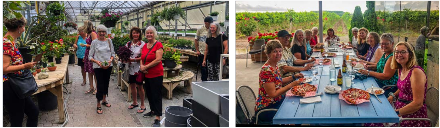
BGC July Outing