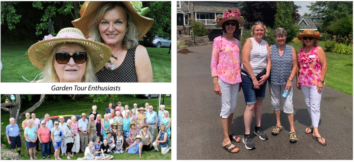
Garden Tour Group Picture