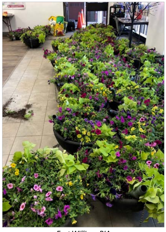
Fort William BIA