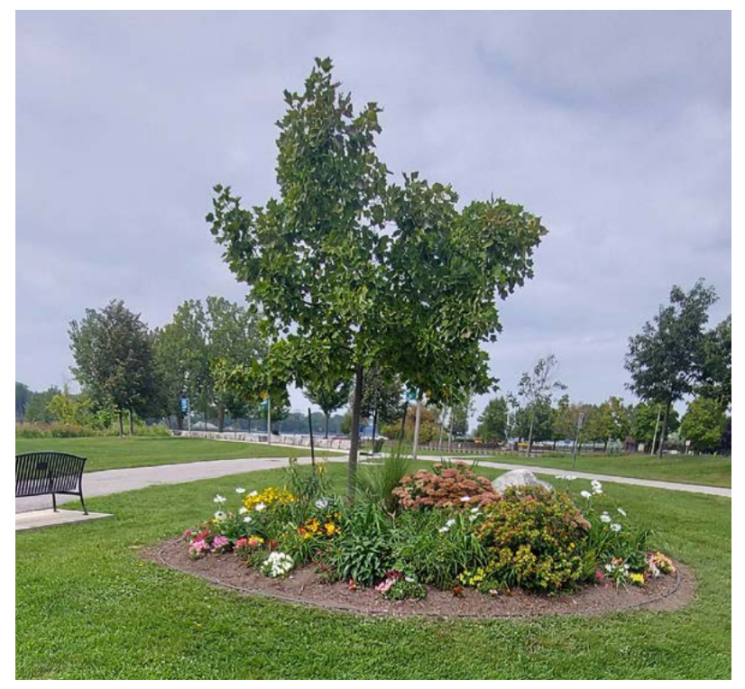
Our Celebration Garden

LaSalle Community Fund (LCF) is a group organized to work in collaboration with residents