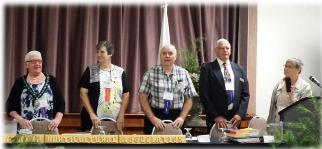
2018 OHA Convention, District 3, Kingston, Ontario