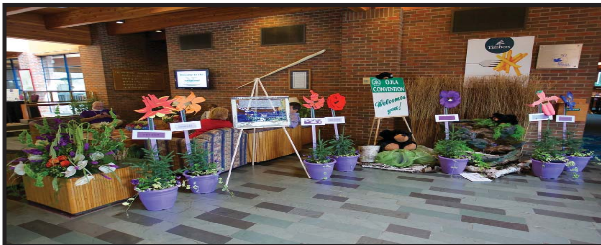
Display at 2013 Convention in Thunder Bay