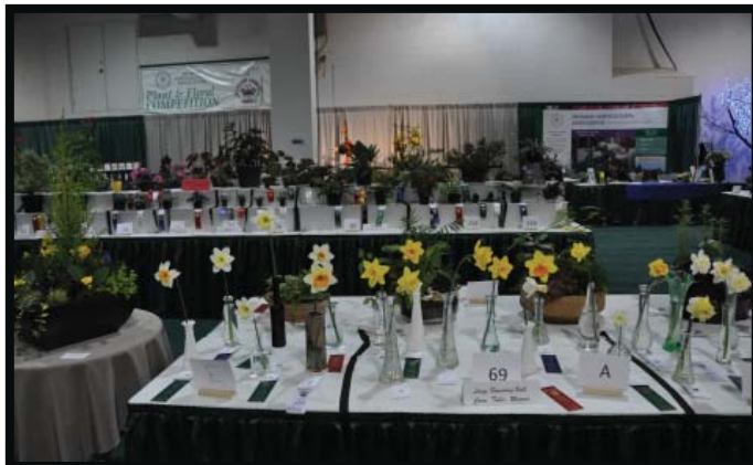
The Ontario Horticultural Association Flower Show at Successful Gardening, Spring 2013.