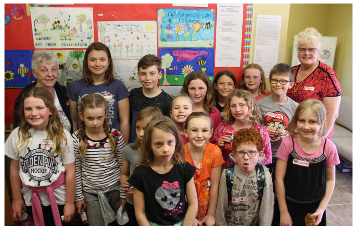
RDHS youth members & leaders with winning poster entries