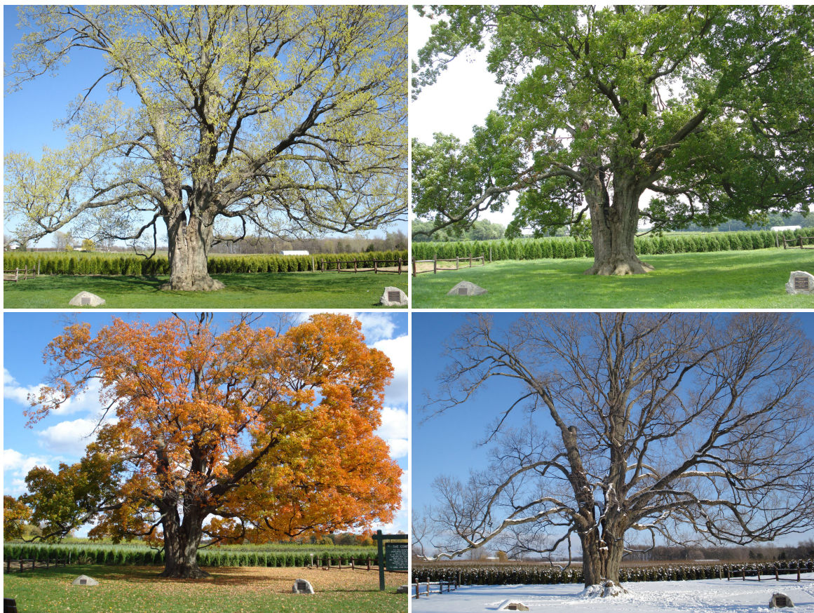
The four seasons of the Comfort Maple

In June of 2000, the Comfort Maple was designated as a heritage tree under the Ontario Heritage Act.