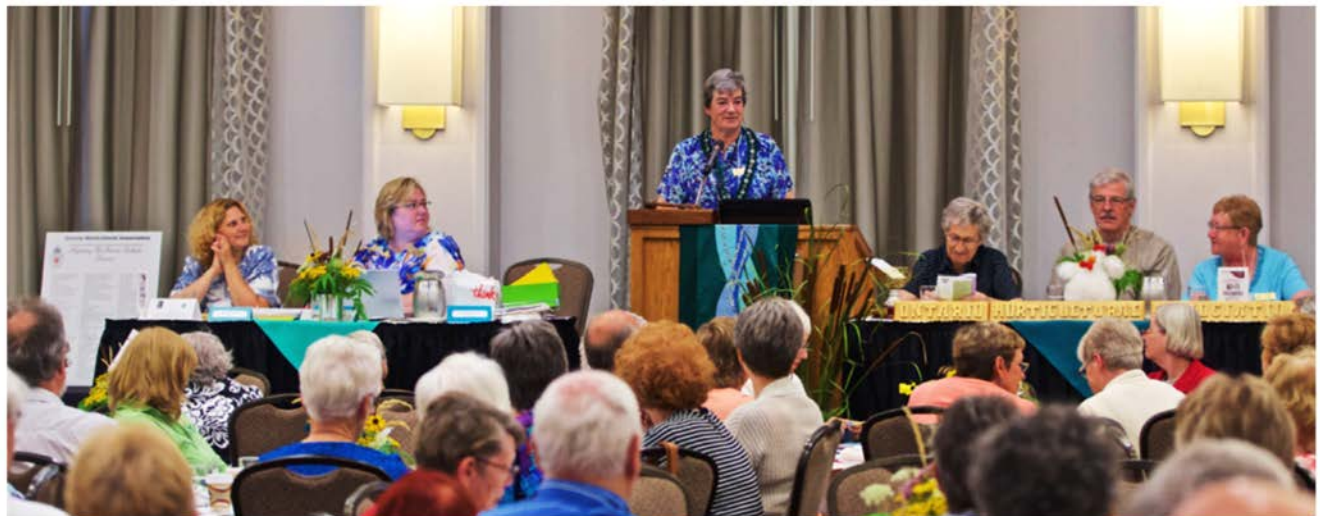
2016 OHA Convention, Kitchener Ontario