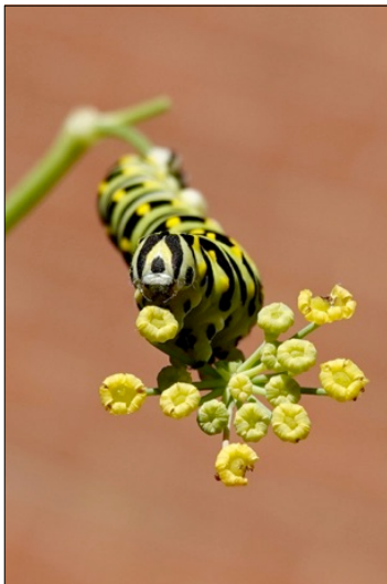
2023 Best in Show, Pat Rose

Your photo may be chosen Best in Show or selected for the 2024 GBGC Bookmark!