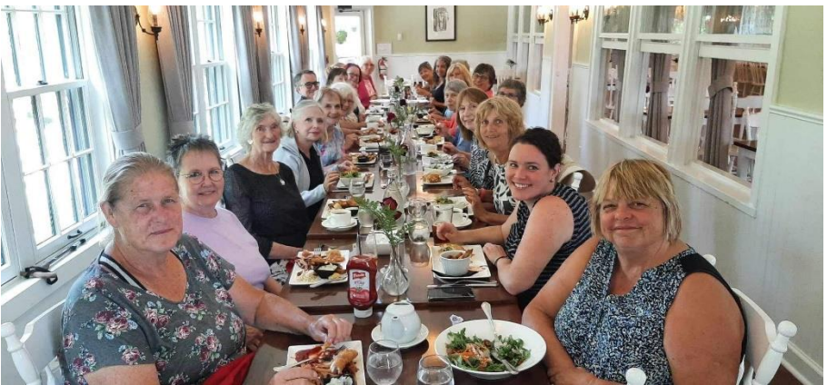
Enjoying lunch at the Opinicon