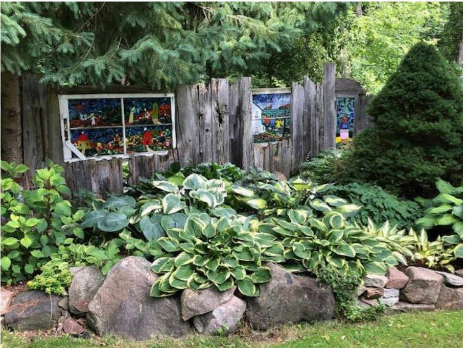
Hetherington Gardens 2023