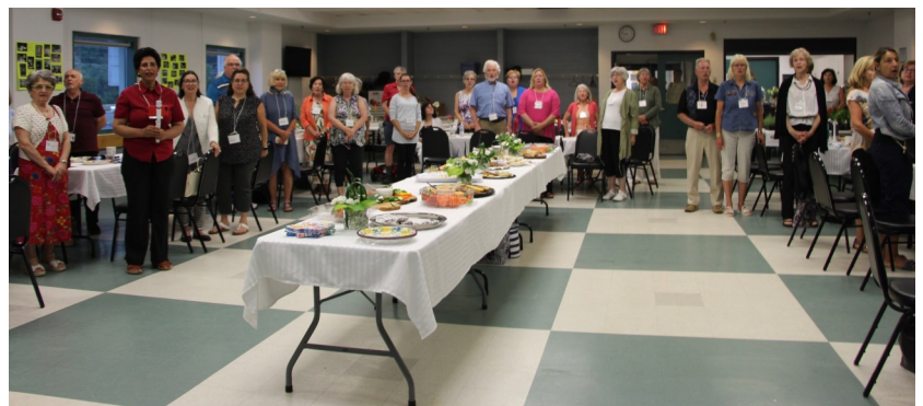
A great overall picture of room and the attendees.