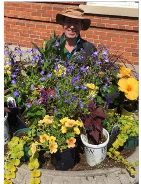
Flowers in colours of Ukrainian Flag to show support.