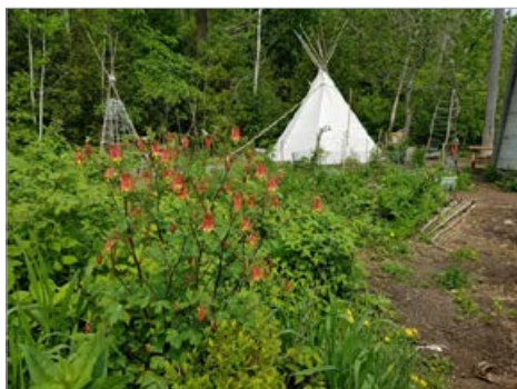
The Indigenous garden at Evergreen Brickworks