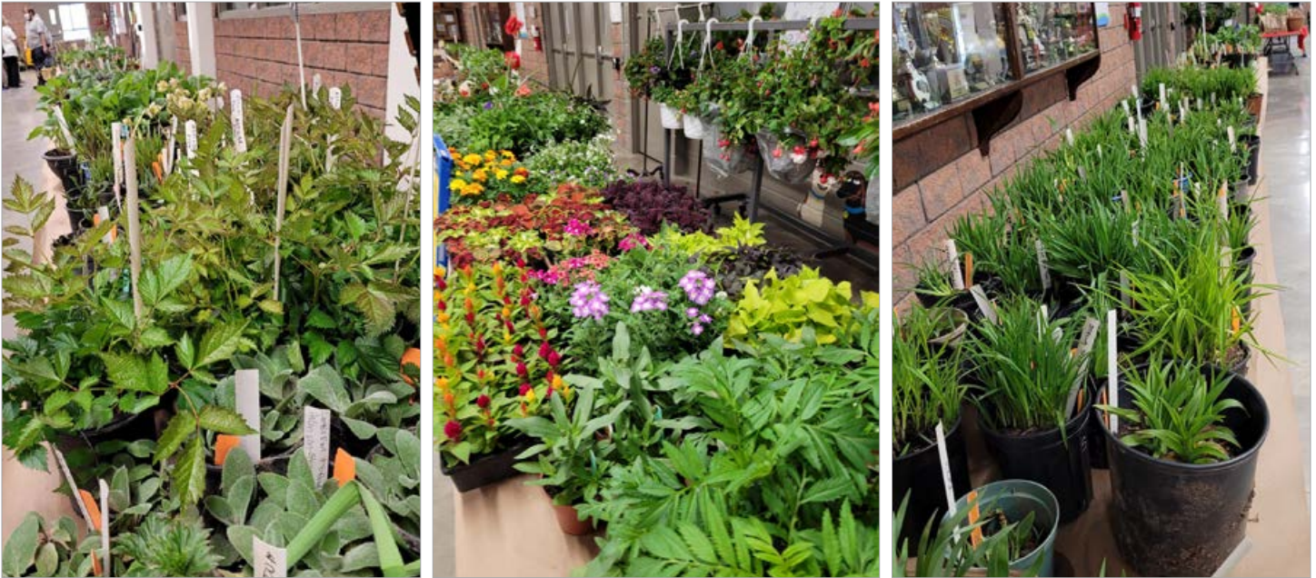
Plant Sale