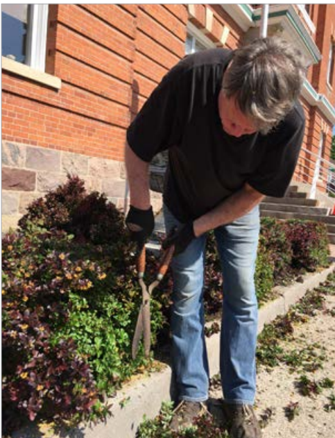
Lots of work beautifying our town hall and tidying up the beds.