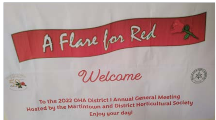
"A Flare for Red" was our theme in The Year of the Garden.

Take care, be safe and happy gardening, till next year.