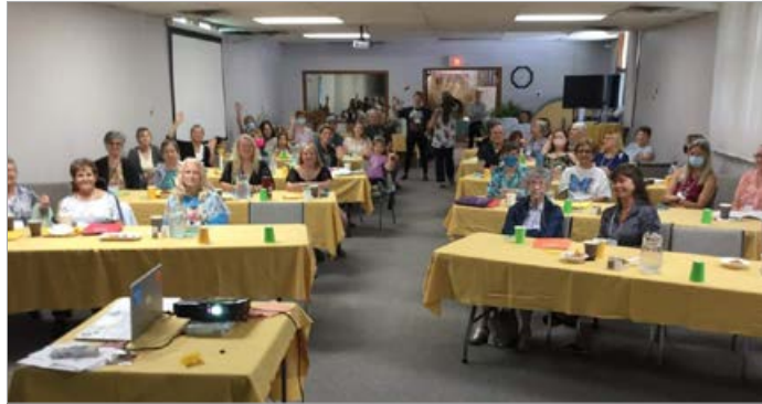
LaSalle Horticultural Society hosts District 11 AGM.

Hello everyone; spring has come and it's almost gone already but we are all happy to get right back into our gardens with great enthusiasm.