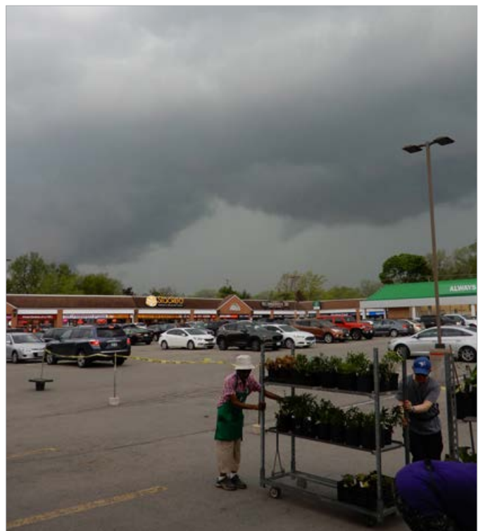
Plant Sale