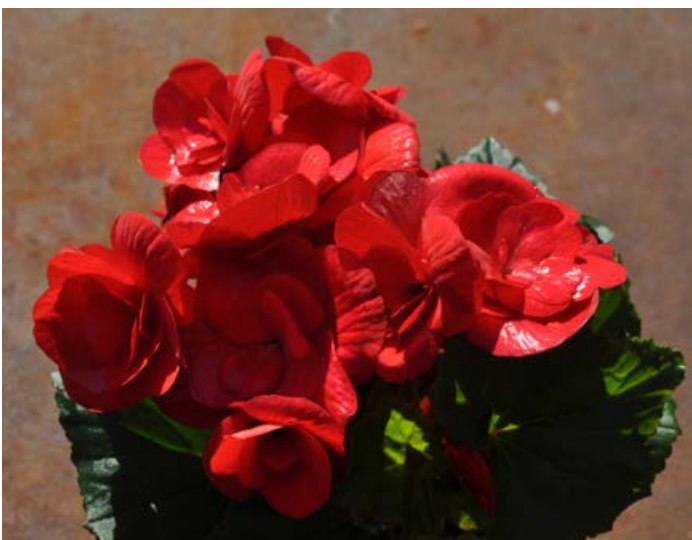
My Begonia Riegel from a local farmers' market