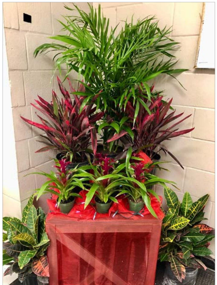
The Martintown & District Horticultural Society was the host of the District 1 Annual General Meeting