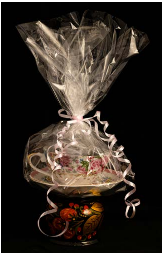
Seed Bombs were packaged in a teacup and sold at the Bath Sunday Market for Mother's Day.

Seed Bomb Workshop: In April, we gathered for our first fundraising event of the year, our seed bomb workshop. We learned to make seed bombs by mixing 3 cups of compost and 2 cups of kitty litter with just enough water to make the mixture easy to handle and shape into balls. Once the balls were formed, they were individually rolled into a variety of floral seeds: wild flower mix, seeds from sunflowers, lupins, Shasta daisies, hollyhocks, coneflowers, cosmos, poppies, and milkweed. Over 300 seed bombs were made during the workshop. After the bombs dried, they were packaged in a teacup and sold at the Bath Sunday Market for Mother's Day. Hopefully as a result, we will soon be seeing new flowers spring up all over the Bath area. Thanks to our workshop leaders Mary Drinkwater and Judy Hume for a great day.