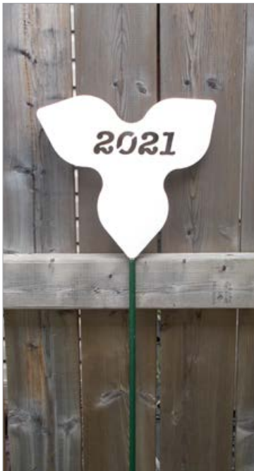
A sample of a Trillium sign

As the summer brings on more projects for our society, we have two pollinator gardens going in. One will be on the property in the town of LaSalle in Vince Marcotte Park. The other pollinator garden will be at a canoe company property along River Canard. Both projects will include the new youth members. Our society is very excited to have received two