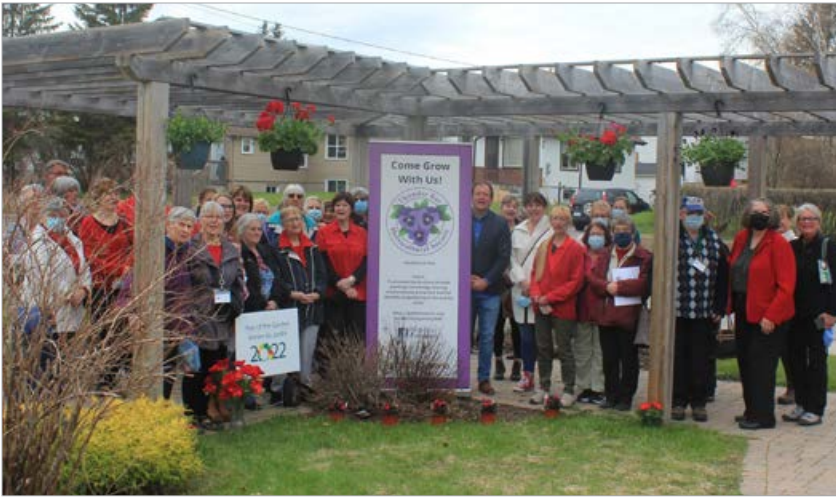
Public “Year of The Garden” Proclamation