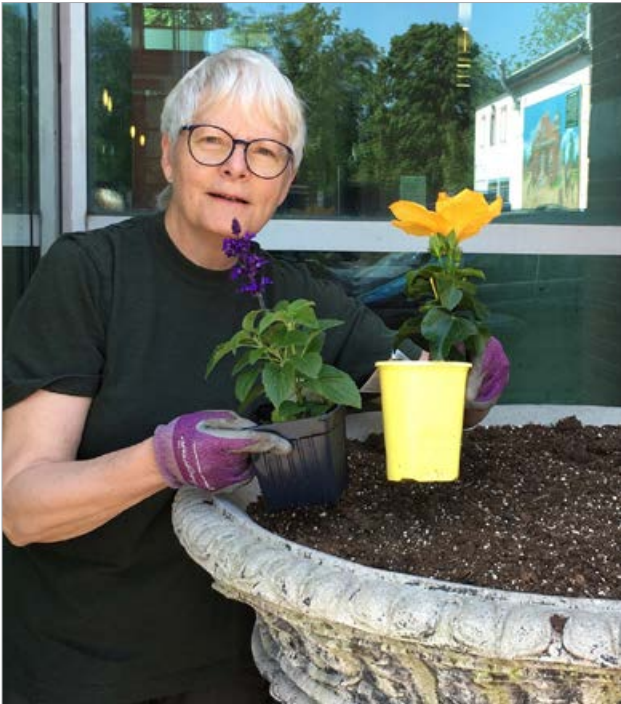
Bowmanville Horticultural Society chose blue and yellow flowers.