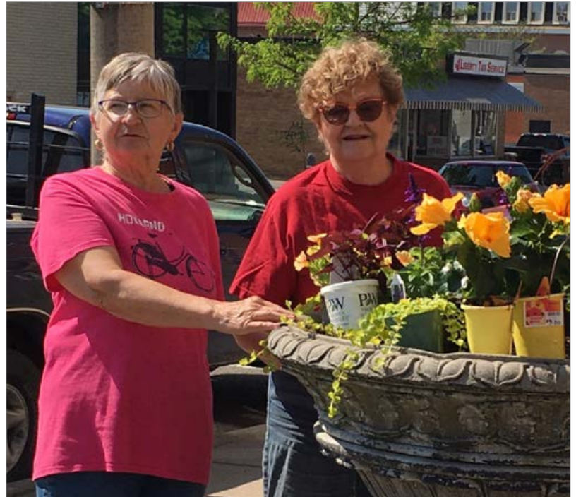
Members of Bowmanville Horticultural Society working together.