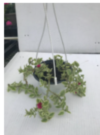
Aptenia cordifolia variegata (Ice Plant) - Hanging Basket $8.00