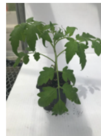
Beaverlodge Slicer Tomato $3.50