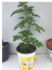
Citronella (Pelargonium 'Citrosa') $7.00