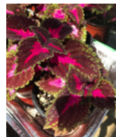
Coleus - bright pink centre with green border $3.50