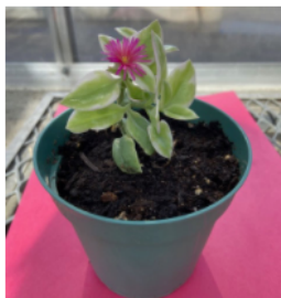
Aptenia cordifolia variegata (Ice Plant) $4.50