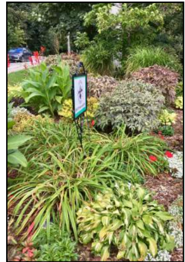
Millennium Park (Wilson St. & Montgomery Dr.)