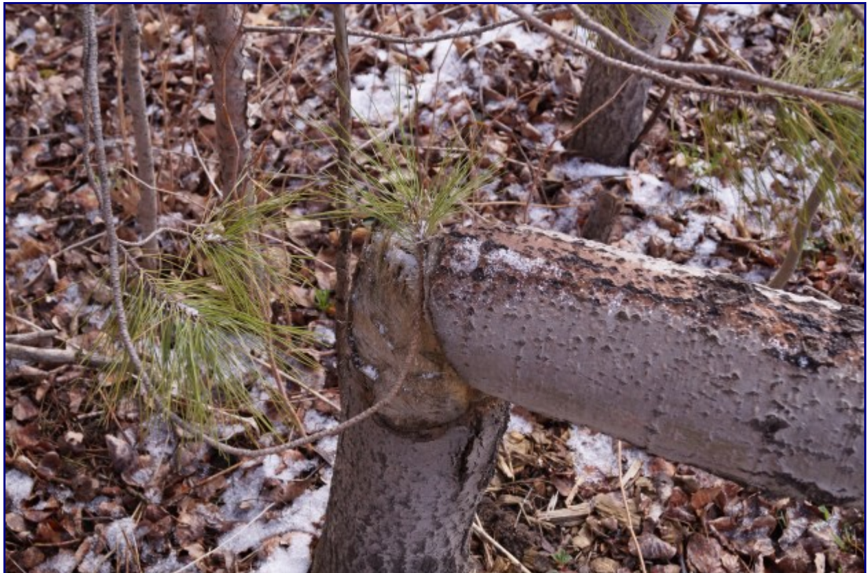
A family of beavers moved into the Arboretum in the fall/winter of 2012/13