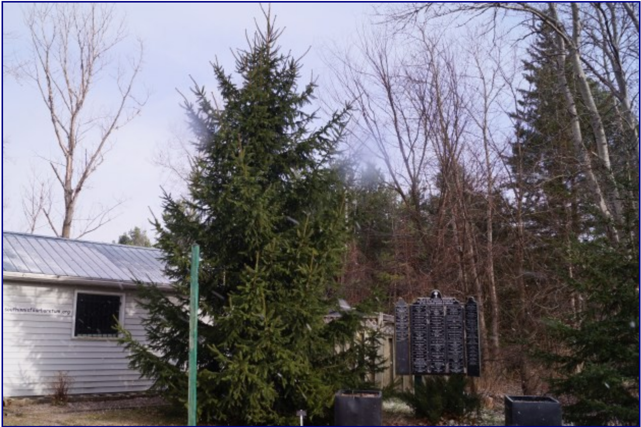
This Colorado Spruce in front of the Garage is dedicated In Honour of the Past Presidents of Gillford & District Horticultural Society