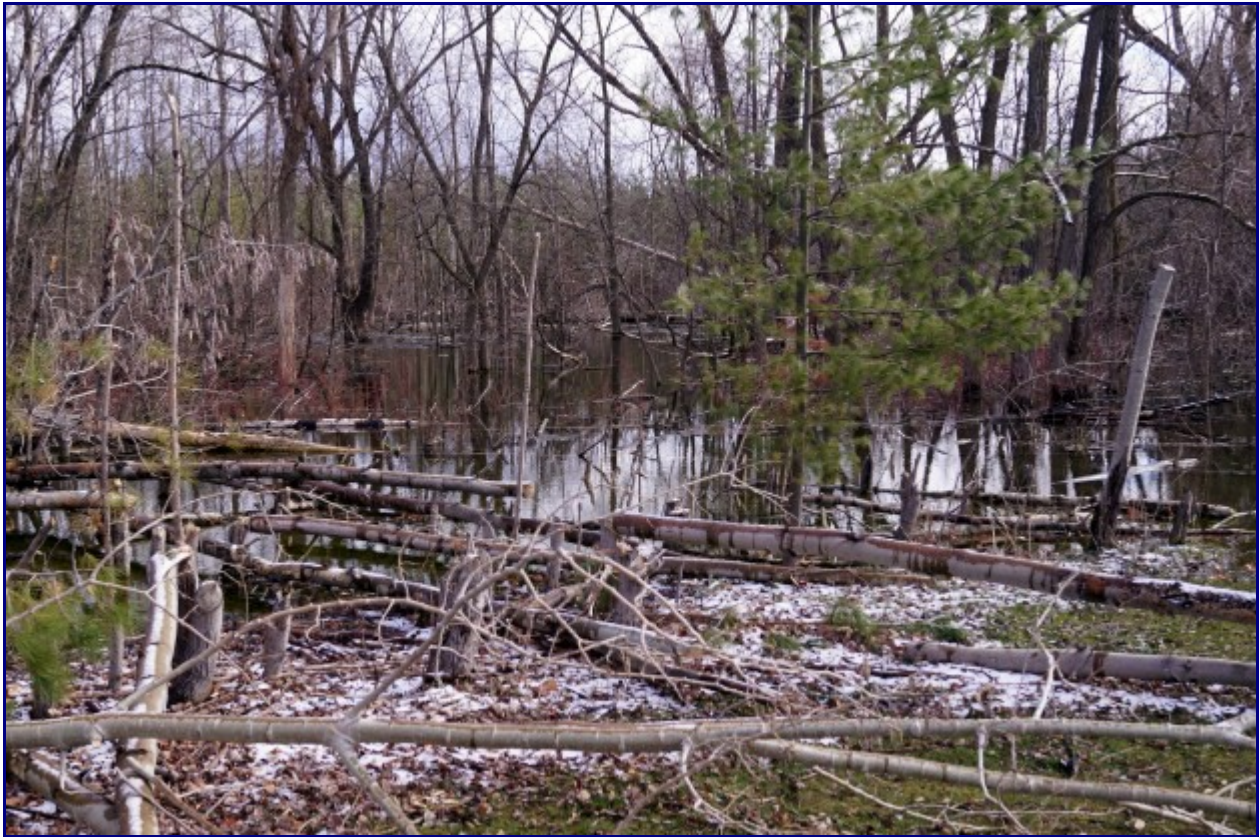
The result is a large flooded area in the northern unused area of the property. Steps have been taken to divert water into the pond so our sponsored trees will not be affected