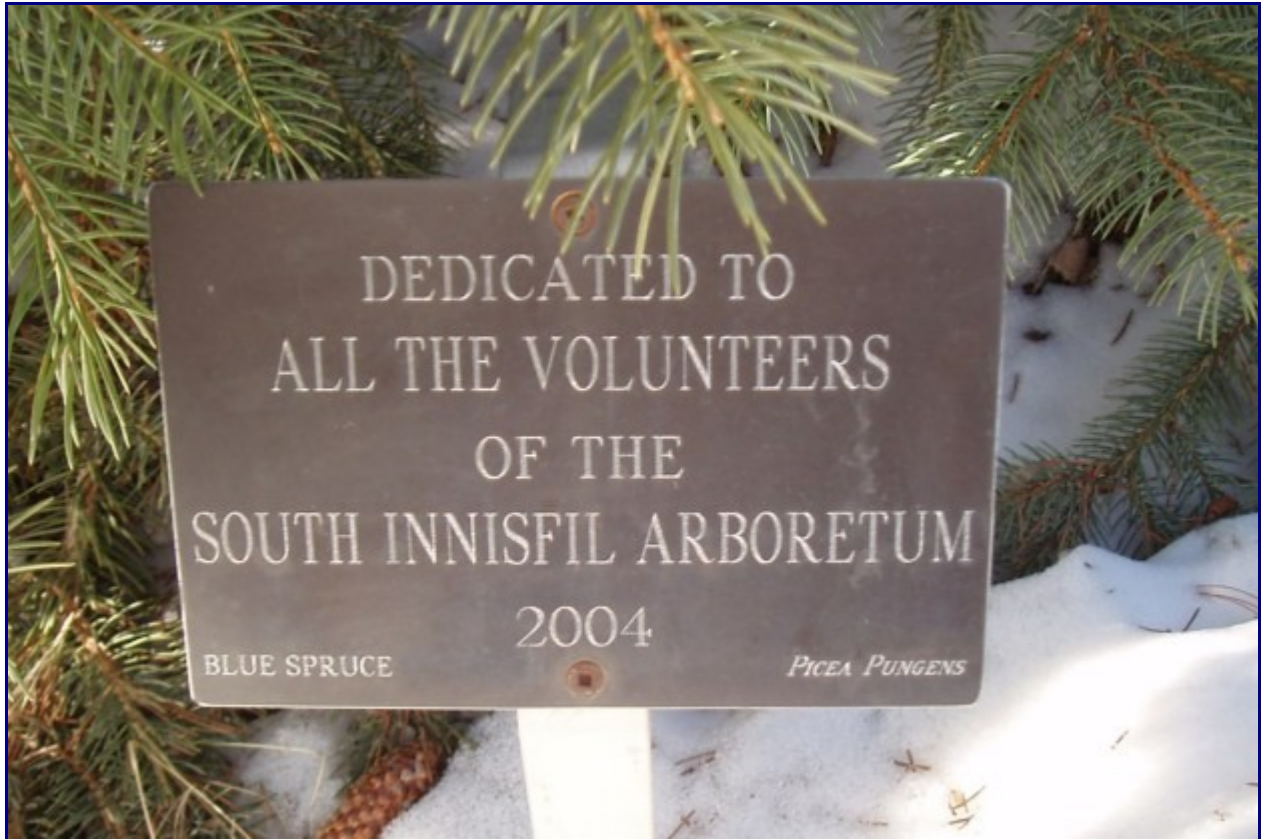
As you can see the dedication took place in 2004