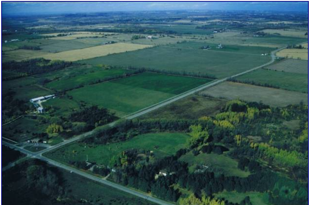
An areal photo taken of the South Innisfil Arboretum

I have called this page “This and That” but it could have been called “Going Down Memory Lane”