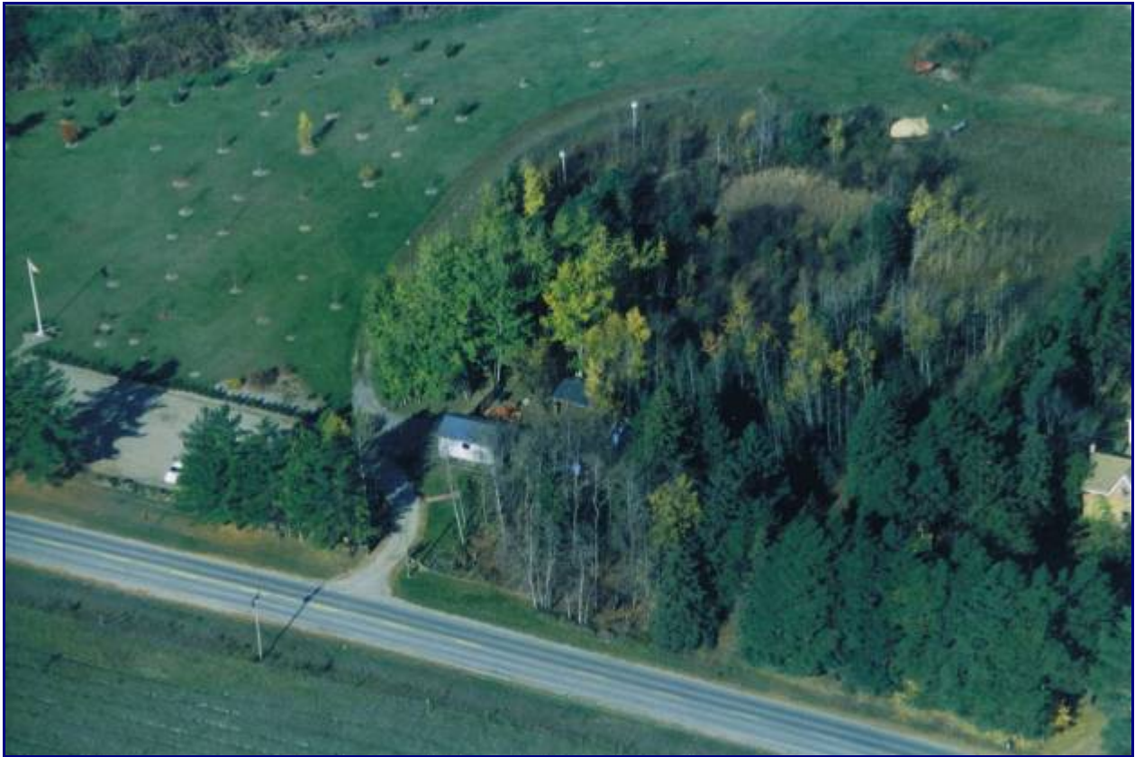
This areal photo shows our garage and the trees that have been planted in the lower meadow