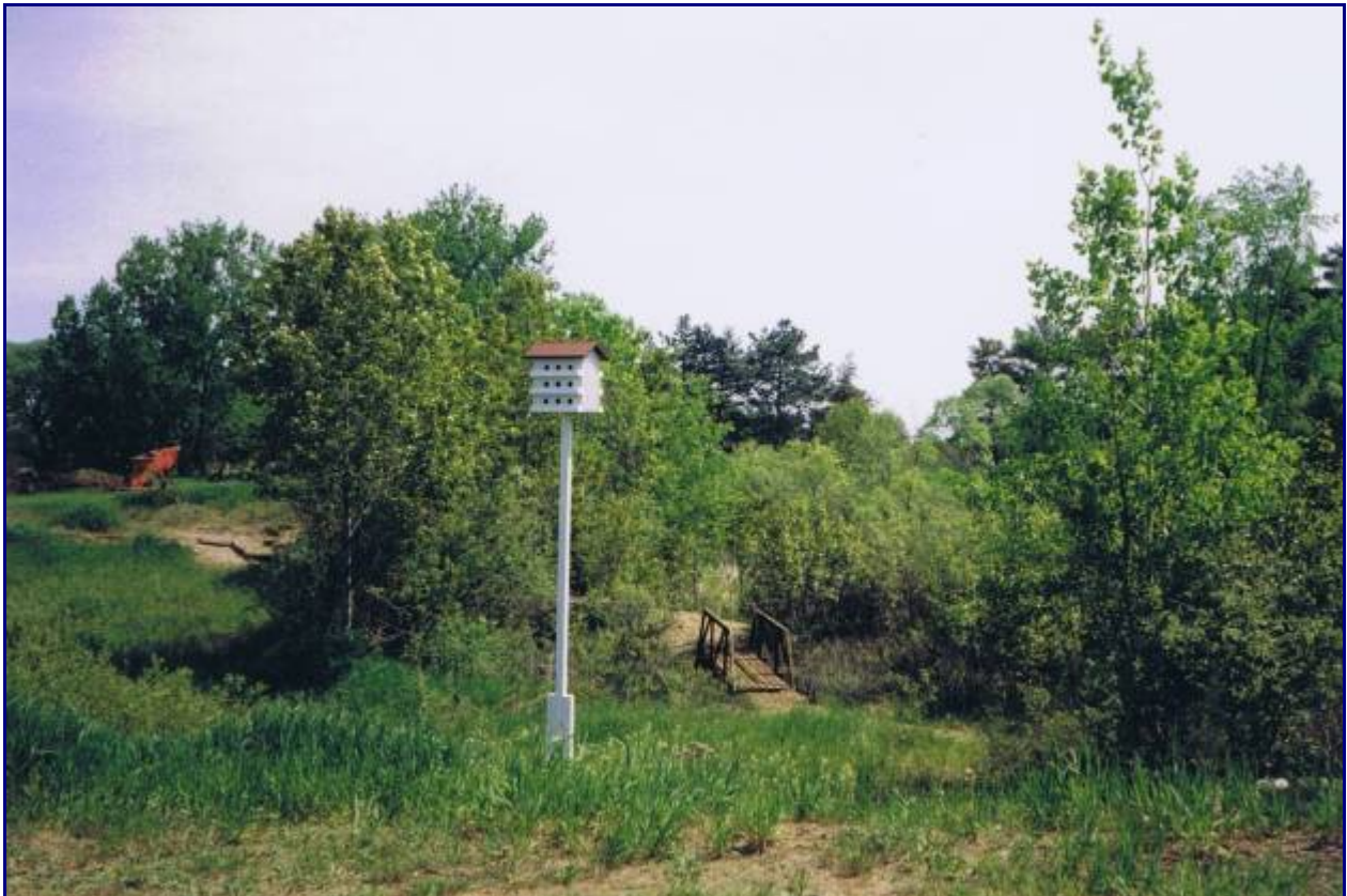
The birdhouse still exists but unfortunately the bridge is no longer there