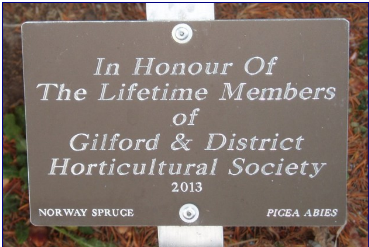
The dedication took place in 2013