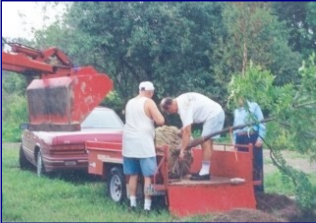
Note the various steps involved in a tree planting