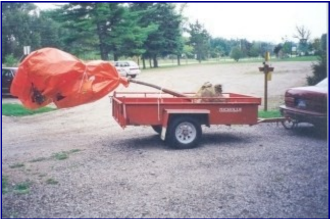
1999 - The final Grove tree arrives a 'Black Walnut'