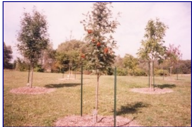
1995 - The Arboretum is taking shape

To familiarize yourself with the trees planted in the Arboretum go to ‘The Trees’ page.