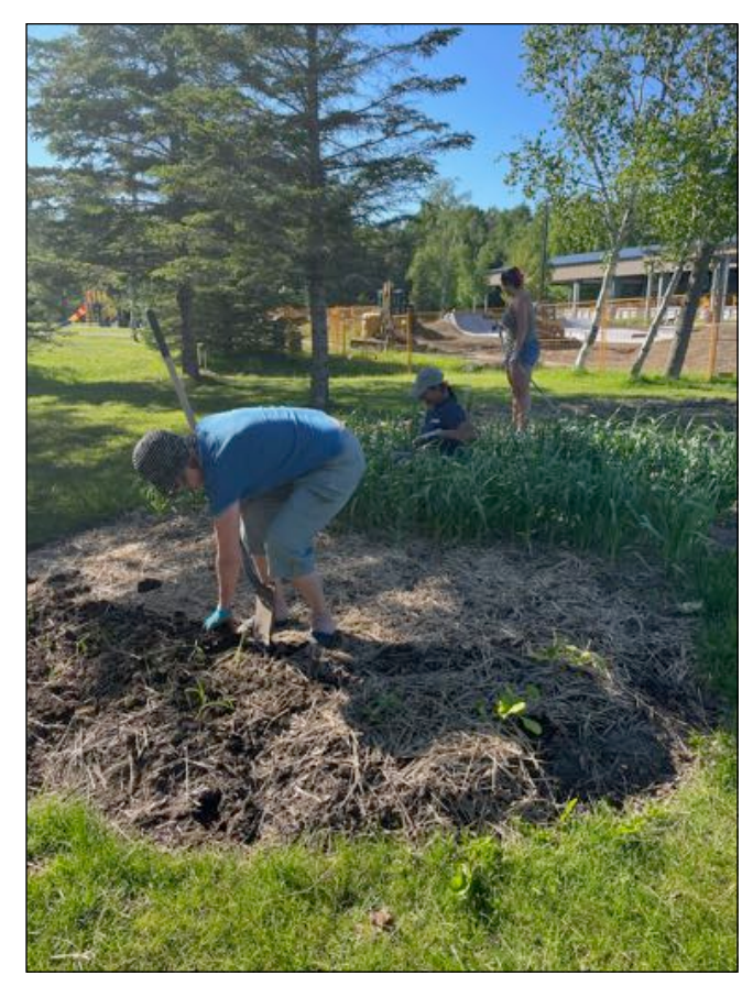
Watch Us Grow!

There's been a lot of activity at the Pefferlaw Community Garden!