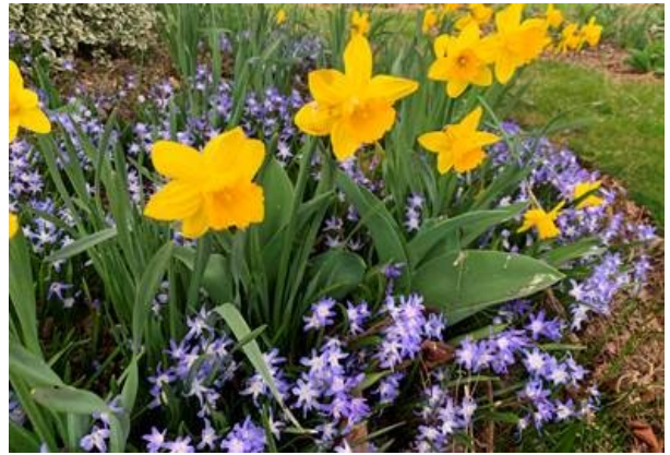
Some early spring bulbs in Michele P.'s garden.