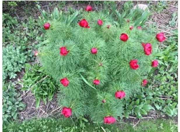
Fern Peony – at last count, there were 23 blooms!