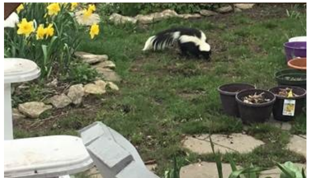
This little fella doesn't smell as sweet! lol