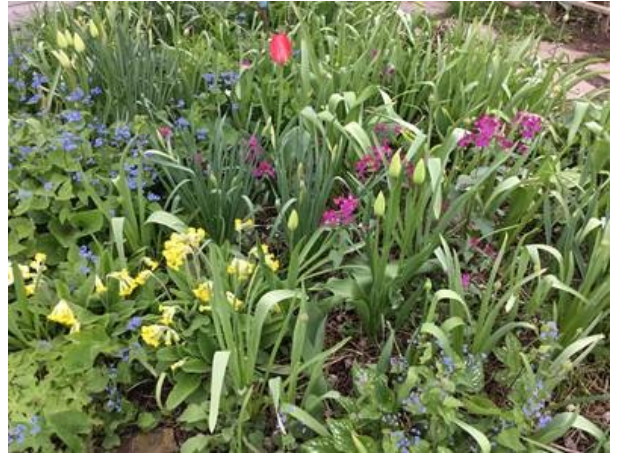
Tulips, Candelabra Primulas, Brunnera and Lunaria Money Plant.