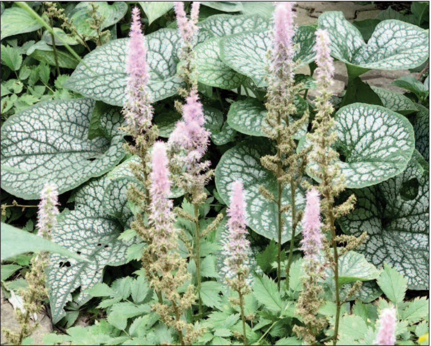
Virtual Garden Tour—Karen Keay's garden