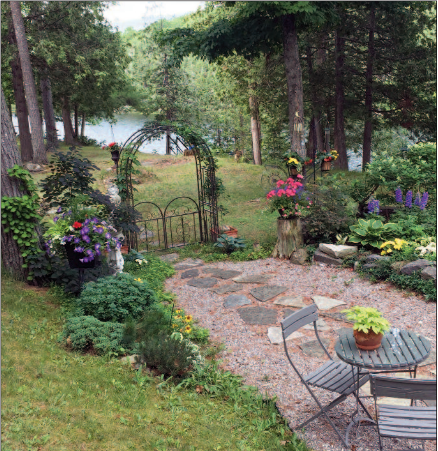
Virtual Garden Tour—Eileen Fitzpatrick's garden