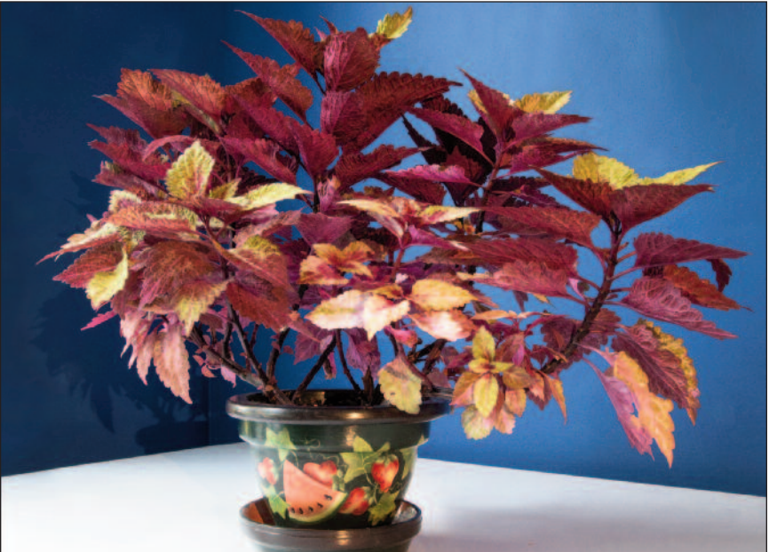
Coleus overwintered indoors from an outdoor planter entered by Brooke Weslak in the September Virtual Show

The show team will format the photos into a PowerPoint presentation that will be emailed to members in early March.