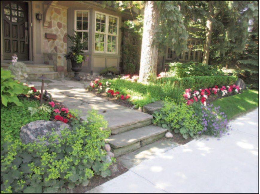
One of the Gardens of Distinction—116 Bessborough Drive