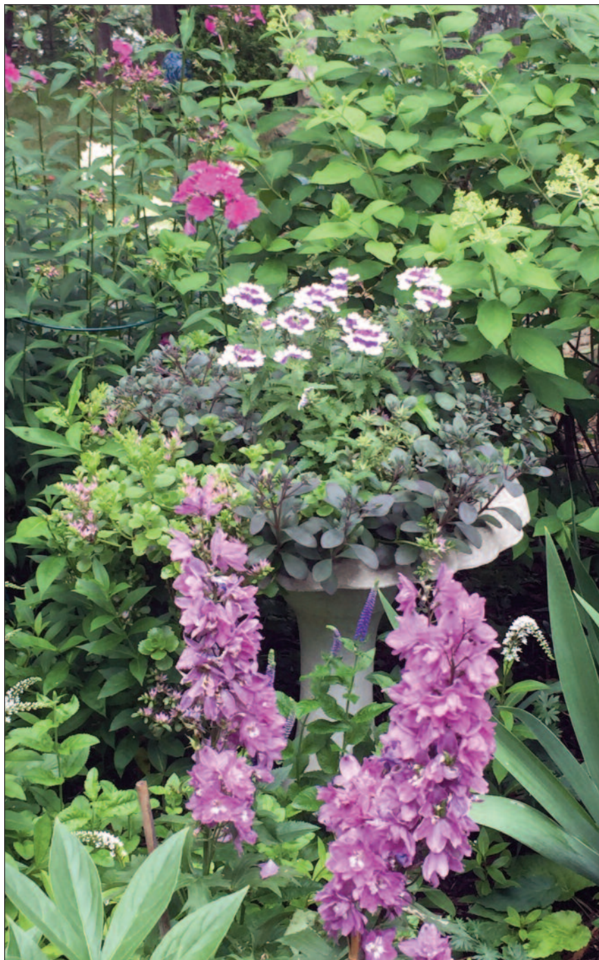
Virtual Garden Tour—Eileen Fitzpatrick's garden