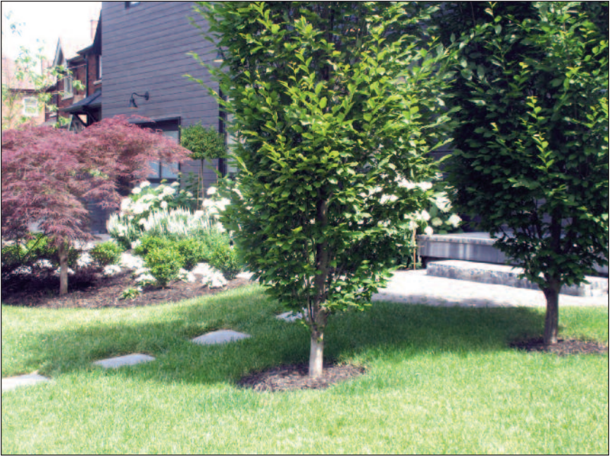
One of the Gardens of Distinction (Honourable Mention)—102 Leacrest Road