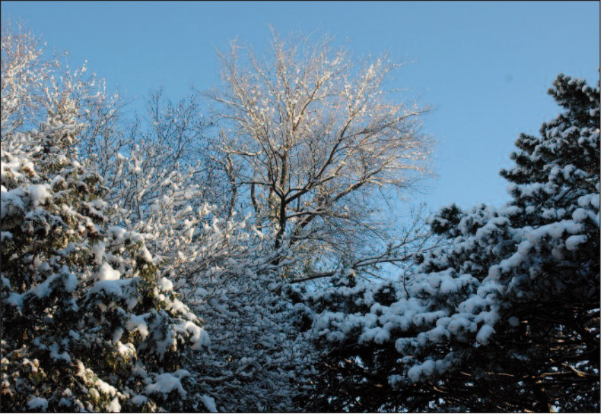
Virtual Garden Tour—Deborah Browne’s garden

me know if there is anything that you would like to be publicized such as special articles. Be sure to Reach for The Sky!