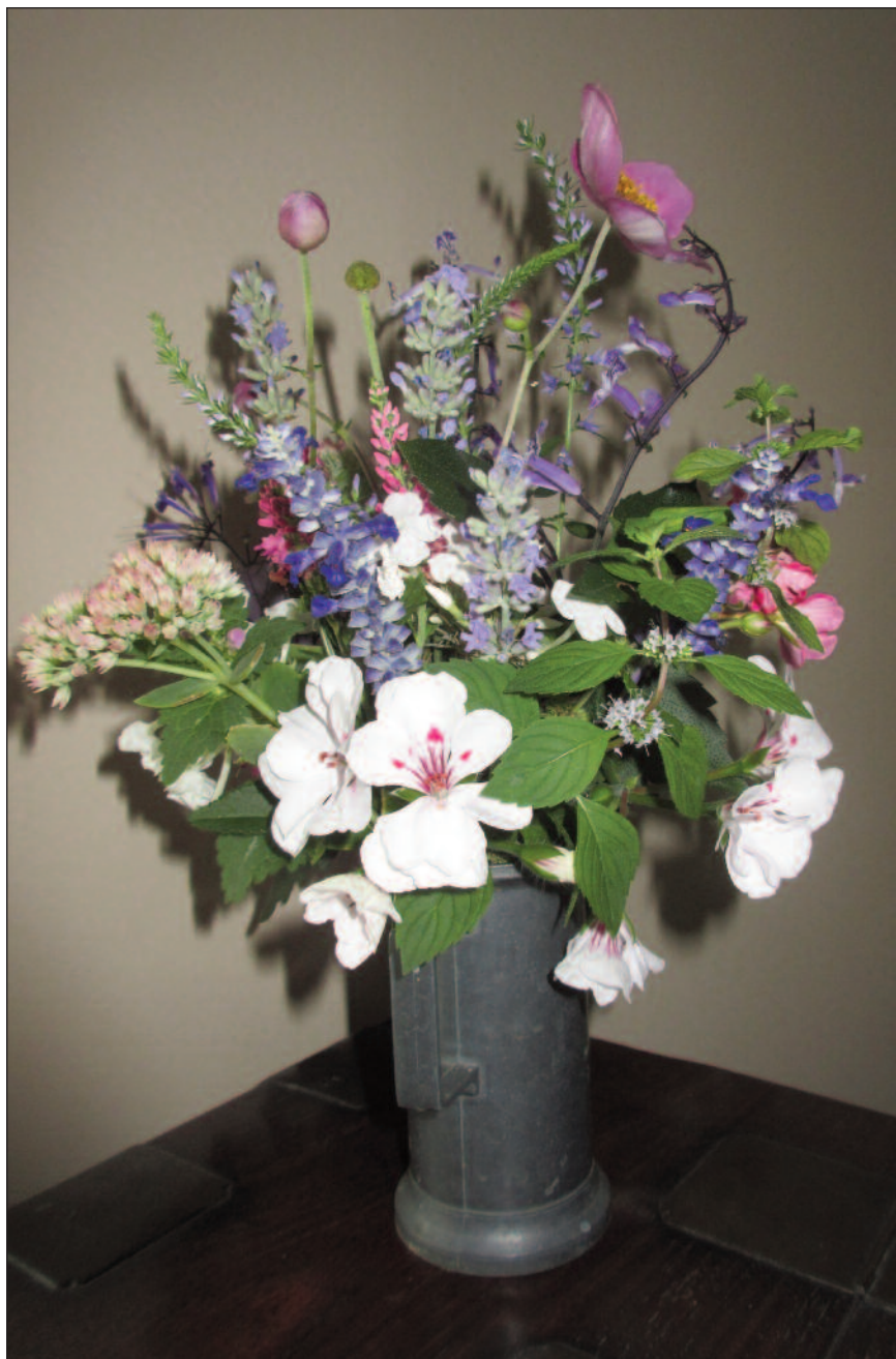
A collection of flowers entered by Joanna Blanchard in the September show