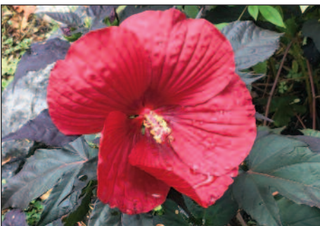
Virtual Garden Tour— Eileen Fitzpatrick's garden