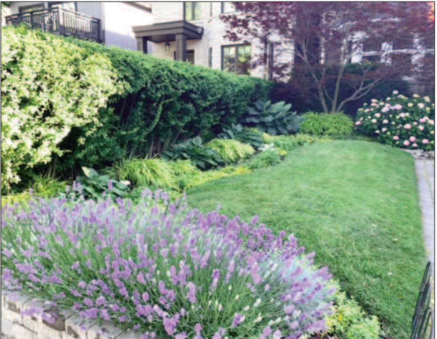
One of the Gardens of Distinction—70 Donegall Drive