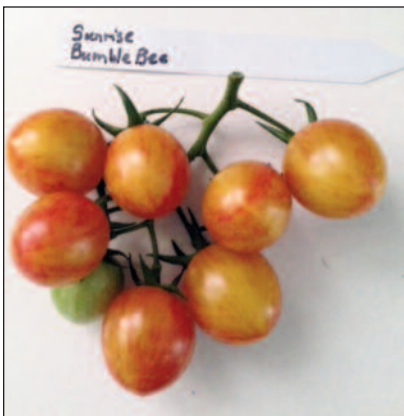
Tomatoes—Sunrise Bumble Bee—entered by Chris Halpern in the September Virtual Show