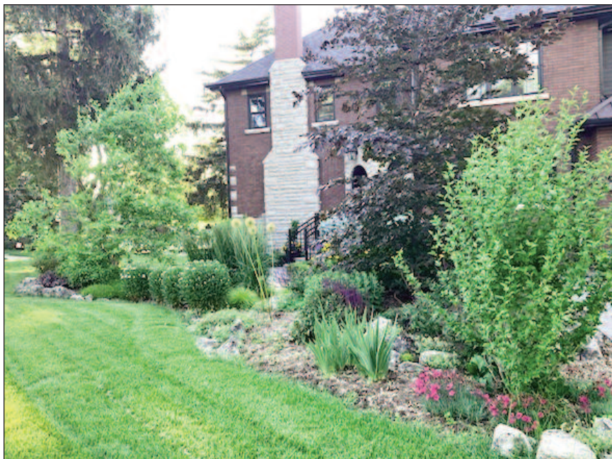
One of the Gardens of Distinction—107 Bessborough Drive