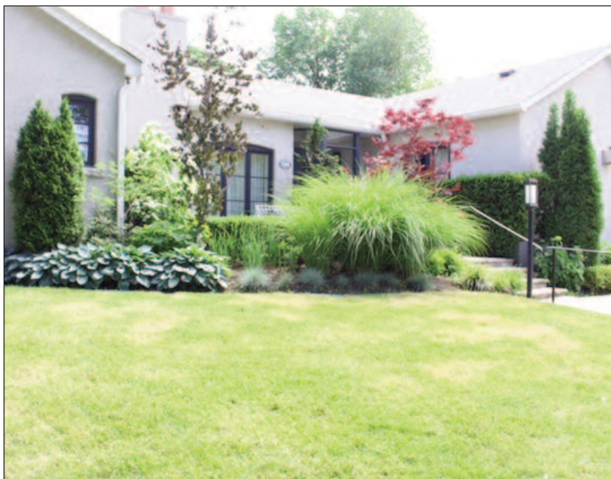
One of the Gardens of Distinction—184 Noel Avenue