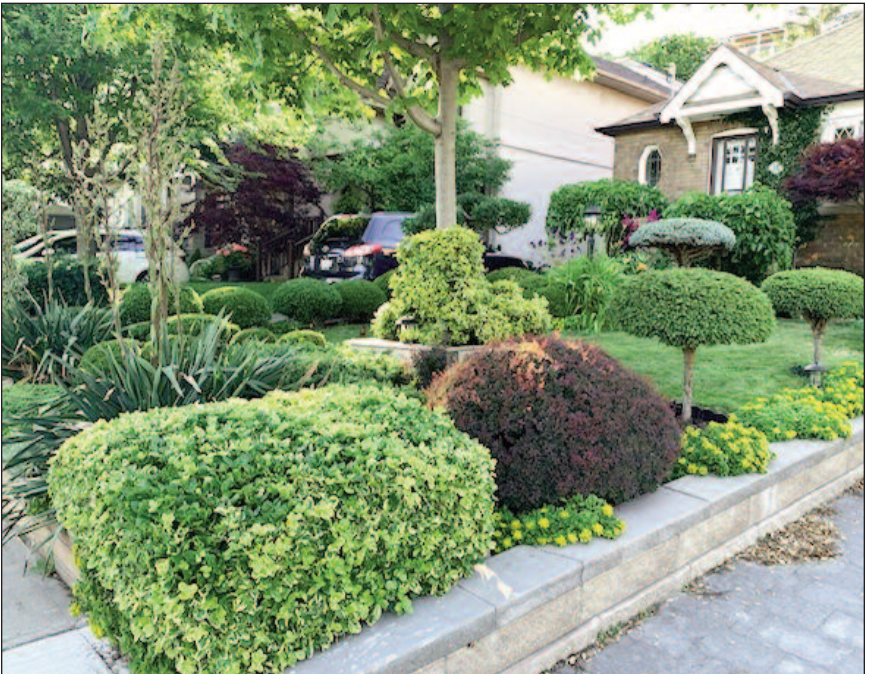
One of the Gardens of Distinction (Honourable Mention)—98 Parklea Drive