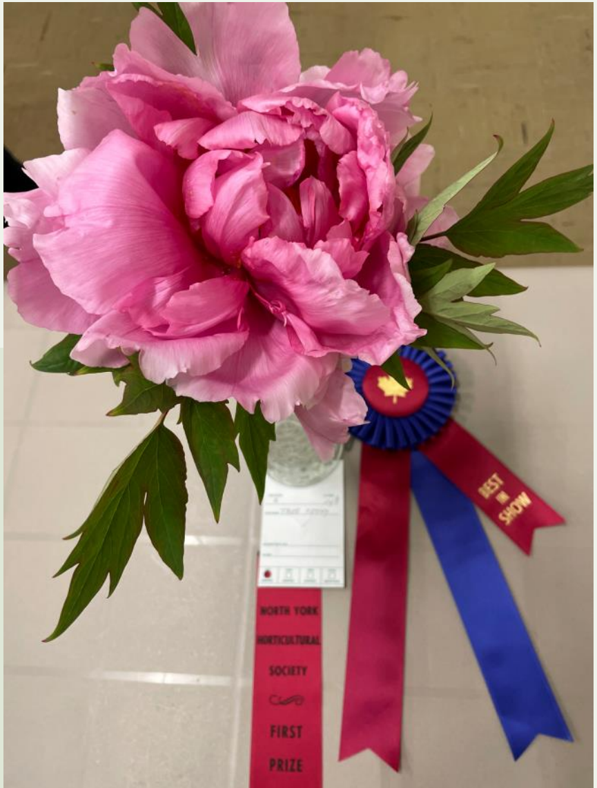
May 2025 Flower Show - Best in Show Louise Veffers' Tree Peony