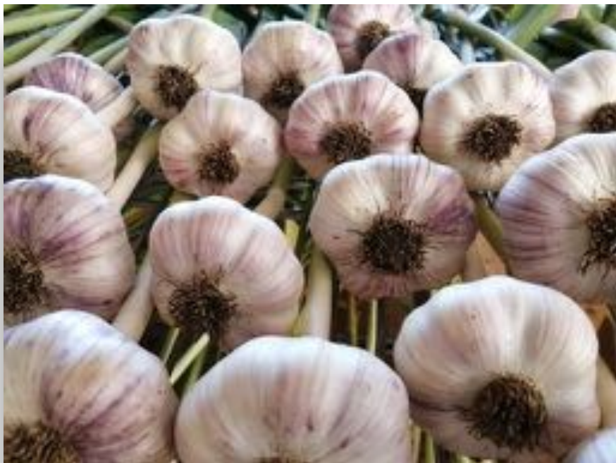
"Fantastic Feast" by Ritsuko Honda