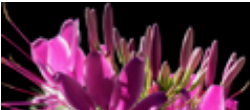
Garden Cleome from Mark Blackden