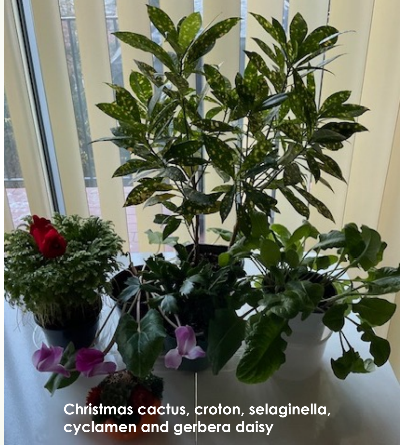
Christmas cactus, croton, selaginella, cyclamen and gerbera daisy