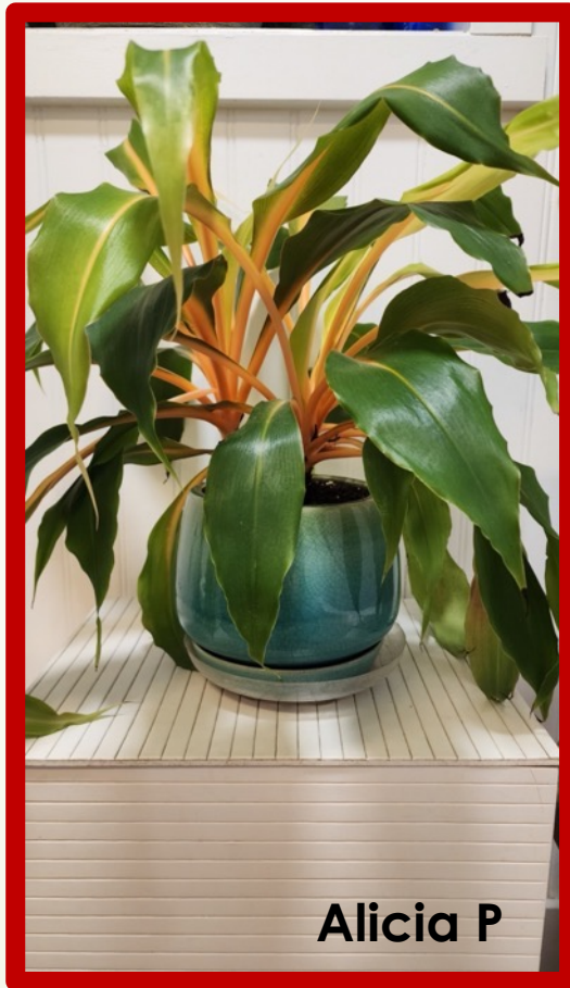
< Mandarin Plant Chlorophytum Mandarin "Fire Flash"