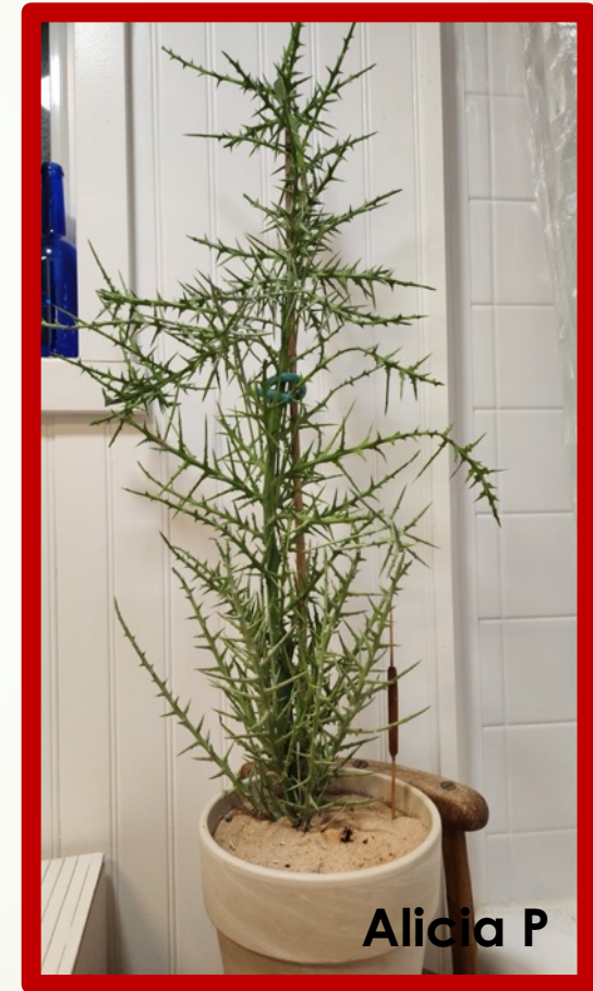
> Eubhorbia stenoclada "Silver Thicket"