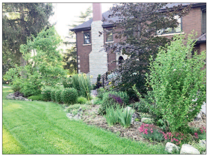
One of the Gardens of Distinction-107 Bessborough Drive