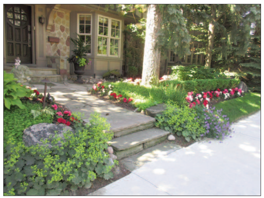
One of the Gardens of Distinction-116 Bessborough Drive