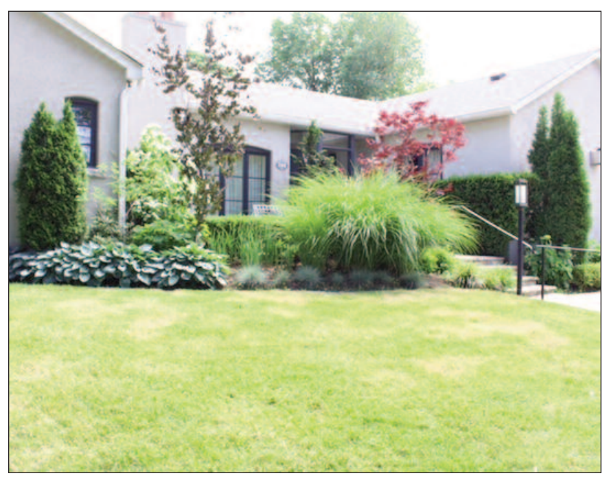
One of the Gardens of Distinction-184 Noel Avenue