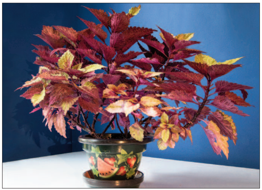
Coleus overwintered indoors from an outdoor planter entered by Brooke Weslak in the September Virtual Show

The show team will format the photos into a PowerPoint presentation that will be emailed to members in early March.