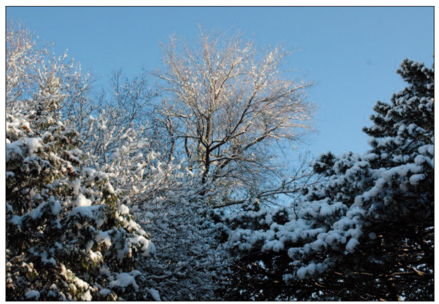
Virtual Garden Tour-Deborah Browne's garden

me know if there is anything that you would like to be publicized such as special articles. Be sure to Reach for The Sky!