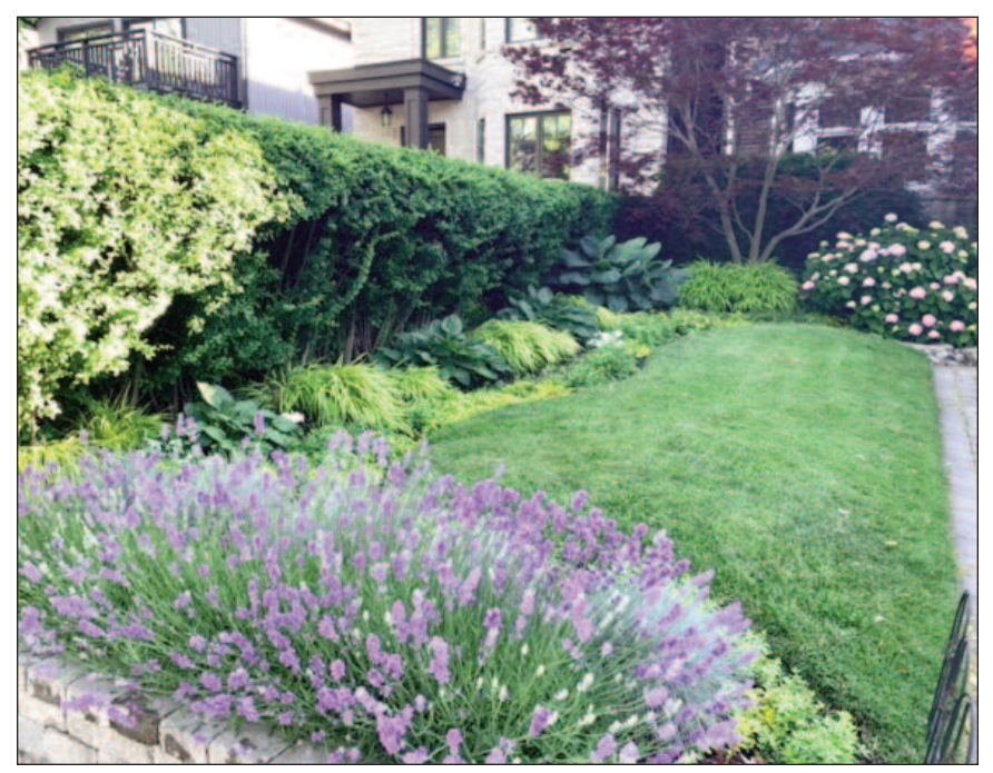
One of the Gardens of Distinction-70 Donegall Drive