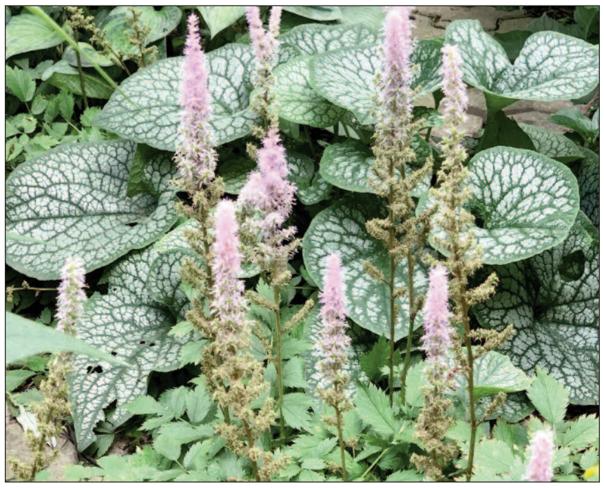
Virtual Garden Tour-Karen Keay's garden