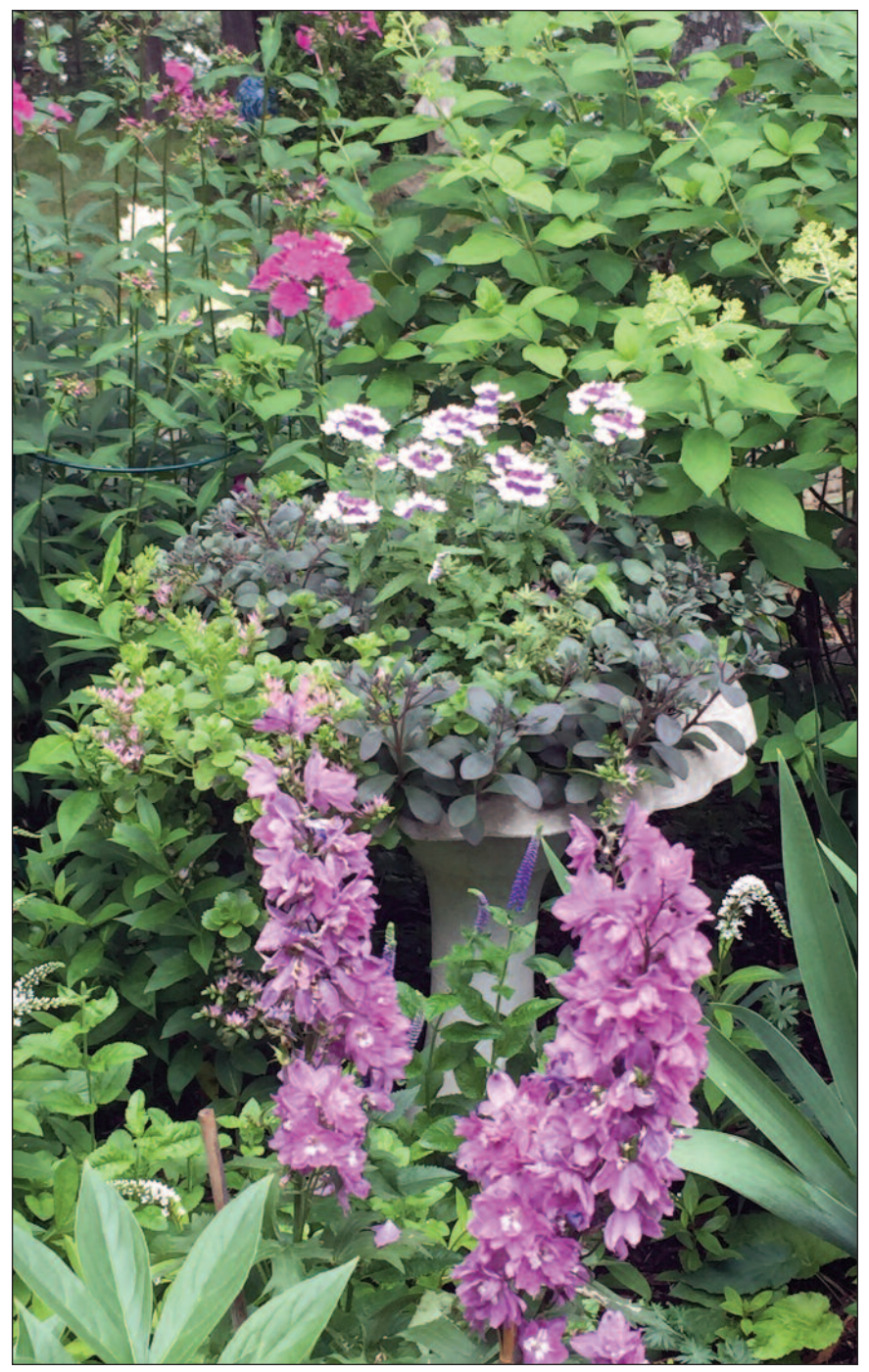
Virtual Garden Tour-Eileen Fitzpatrick's garden