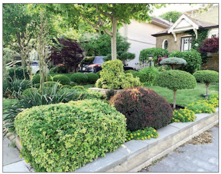
One of the Gardens of Distinction (Honourable Mention)-98 Parklea Drive