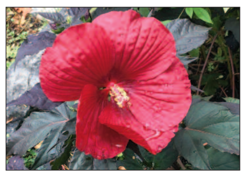
Virtual Garden Tour— Eileen Fitzpatrick's garden