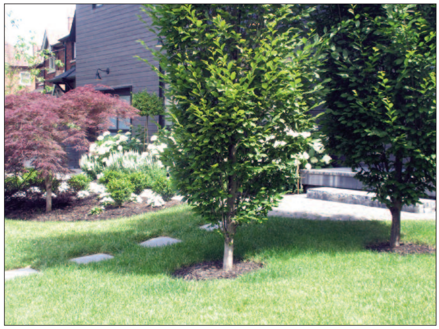
One of the Gardens of Distinction (Honourable Mention)-102 Leacrest Road