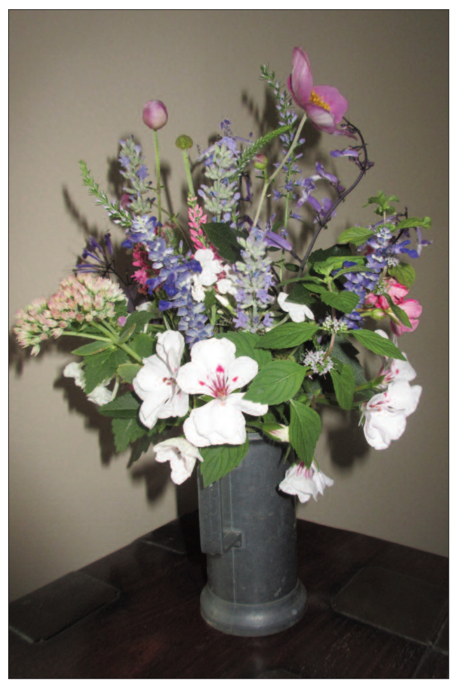
A collection of flowers entered by Joanna Blanchard in the September show